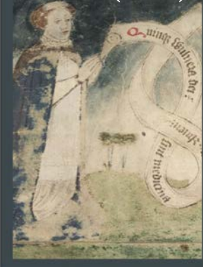
BEINECKE MS 410 (DETAIL)